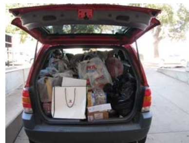
Presents loaded for delivery

The mission of Alliance for Children is to protect Tarrant County children from child abuse through teamed investigations, healing service and community education. For more information visit their website: www.allianceforchildren.org .