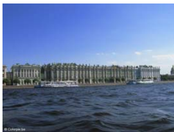
The State Hermitage Museum St. Petersburg, Russia www.hermitagemuseum.org