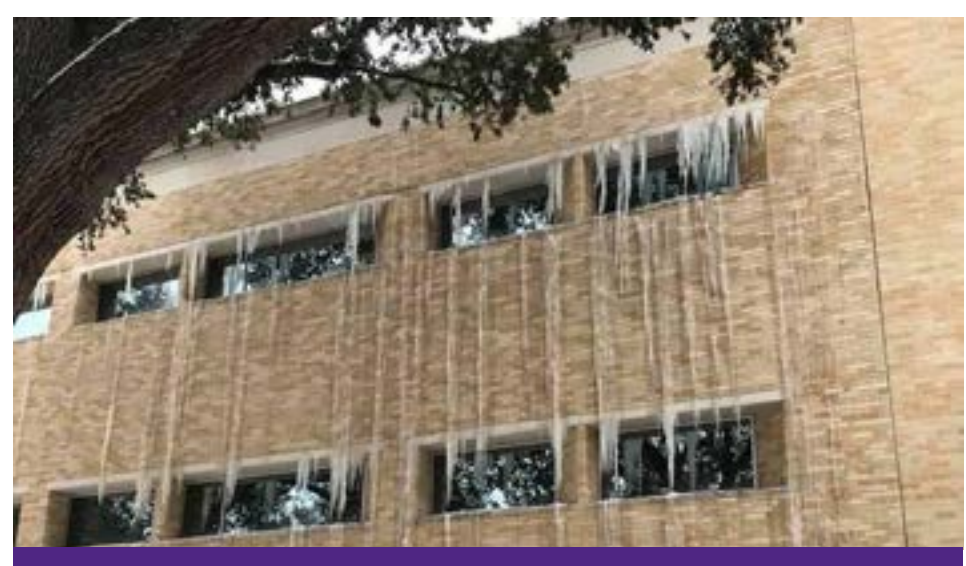
Water coming through the brick on the front façade created mammoth-size icicles.

exhausting and a bit shocking," said Lutz. "To see the condition the library was in, took my breath away." Hull and Lutz worked closely with campus Facilities and Blackmon Mooring to assess the damage, and to begin the cleanup process of removing the water out of the library.