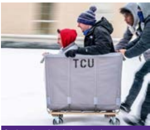
Students have bobsled races in the commons

The TCU campus re-opened Saturday, Feb. 20, but the library remained closed for an additional week. The east side opened Friday, Feb. 28, for normal hours. Additional areas opened mid-March, and we began providing access to books that had been inaccessible. Today, we continue to retrieve books for patrons upon request for curbside